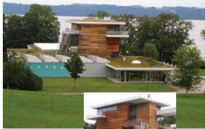
Buchheim Museum, boat-like exterior with grass roofs.

The collections of the late Lothar-Günther Buchheim, painter, photographer, publisher and author of several art books and novels, some of which were turned into blockbuster movies (e.g. the famous "The Boat"), are housed in an open, multi-segment structure that reminds of a large boat. A unique, architectural feature is the deck bridge, forty feet above Lake Starnberg, providing museum visitors with a 180-degree view of aquatic life in and around the lake, the Lake Starnberg lakescape with grand contemporary and historical residences, onion-church towers, and the magnificent snow-covered Alpine Mountains to the South.