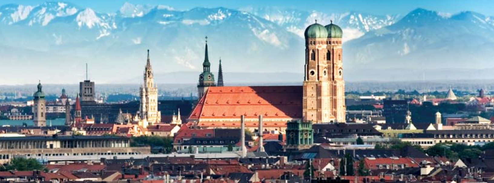
Munich, Bavaria. City skyline in the evening light with the snow-covered Alpine mountains in the background.

Year round, cultural highlights in and around Munich abound, nature and landscape are just breathtaking, with a gigantic, snow covered Alpine mountain backdrop, with world-class ski-slopes, inviting to hike, as well as providing motifs for landscape-photography. Culturally and historically, you will get more than your fill! Take a refreshing break at organic restaurants and relax at eco-resorts.