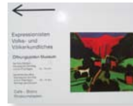
Art, even on the entrance sign: Norwegian Landscape (Skrygedal) Karl Schmidt-Rottluff, 1911

Often referred to as "four museums under one roof," the Buchheim Museum is as multifaceted as the late Buchheim himself and illustrates his versatile talents and interests. The core of the collection are Expressionist paintings, watercolors, drawings, woodcuts, etchings and lithographs predominantly by the artist group "Die Brücke" ("The Bridge"), including Nolde, Pechstein, Kirchner, Schmidt-Rottluff, Corinth, Beckmann, Kokoschka and Dix. The lower rooms house folk art and ethnological artistry, as well as Buchheim's own vividly colored work. Visitors leave the serene premises deeply inspired. www.buchheim-museum.de