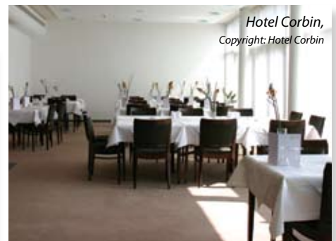
Hotel Corbin, Copyright: Hotel Corbin