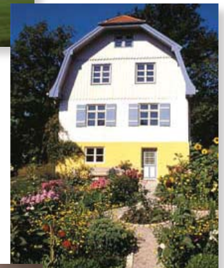
Gabriele Münter House, Murnau

At the Schloss (castle) in Murnau, you will find a vast collection of "Blue Rider" work. The castle and the church have been favorite motifs of the artists. www.schlossmuseum-murnau.de