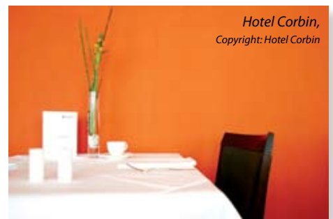
Hotel Corbin