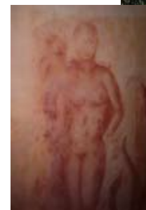
Mural at the Münter House

At the Schloss (castle) in Murnau, you will find a vast collection of "Blue Rider" work. The castle and the church have been favorite motifs of the artists. www.schlossmuseum-murnau.de